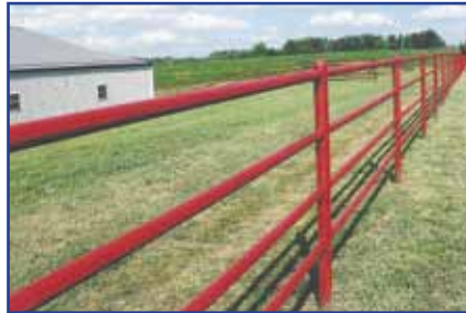
Same Fence with Grab 'em Paint Primer Red Oxide 607 (one coat)