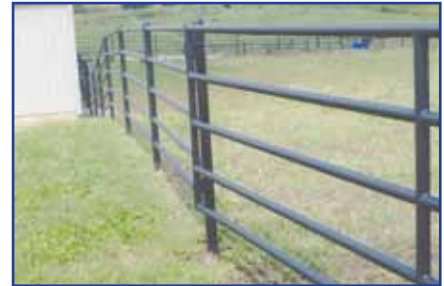
Grab 'em Paint Accent 450 Tinted Black Topcoat (1 of 1000 colors). 6 Years