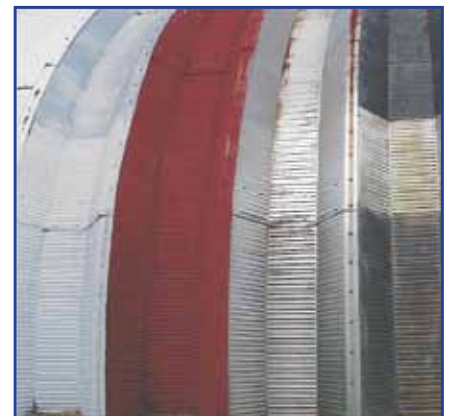
Quonset with Red Oxide 607 Durable for 30 years over Weathered galvanized steel.