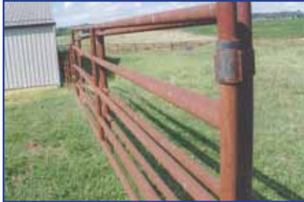
Rusty Iron Fence Not Painted

Best Paint for WOOD - METAL - MASONRY - REPAINT