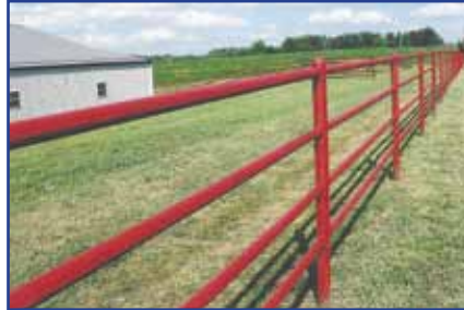
Same Fence with Grab 'em Paint Red Oxide 607 Primer