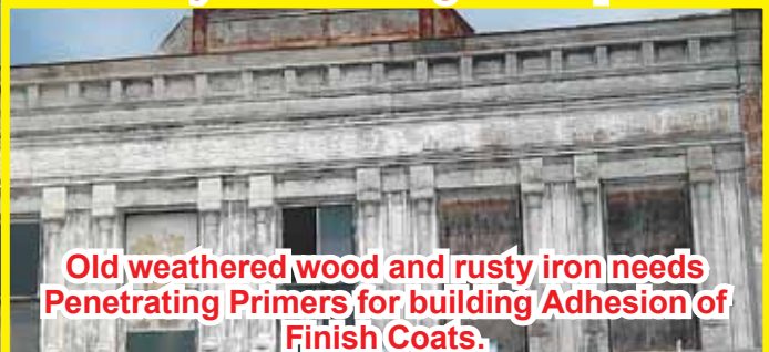
Old weathered wood and rusty iron needs Penetrating Primers for building Adhesion of Finish Coats.