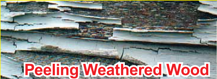
Peeling Weathered Wood