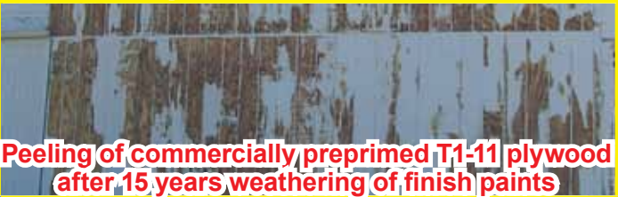
Peeling of commercially preprimed T1-11 plywood after 15 years weathering of finish paints